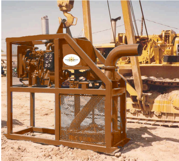
Model DP-8 Ditch Pump-8" (203.2 mm) discharge